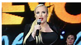
Meghan McCain: 'This Meryl Streep speech is...