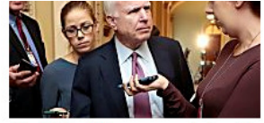
McCain: I'll answer 'stupid, idiotic' Trump questions...