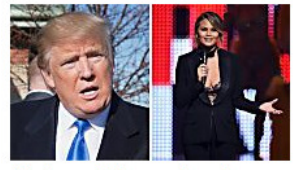
Chrissy Teigen shreds Trump for wanting...