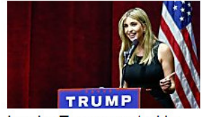
Ivanka Trump quoted in '06 as saying: 'If he...